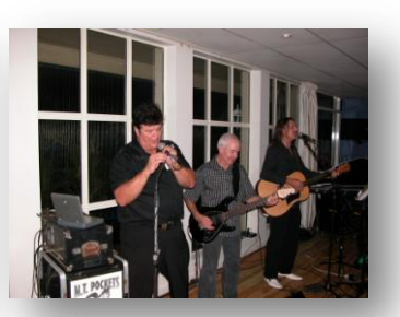
As you see by last year's pictures, our Christmas is a great fun night.